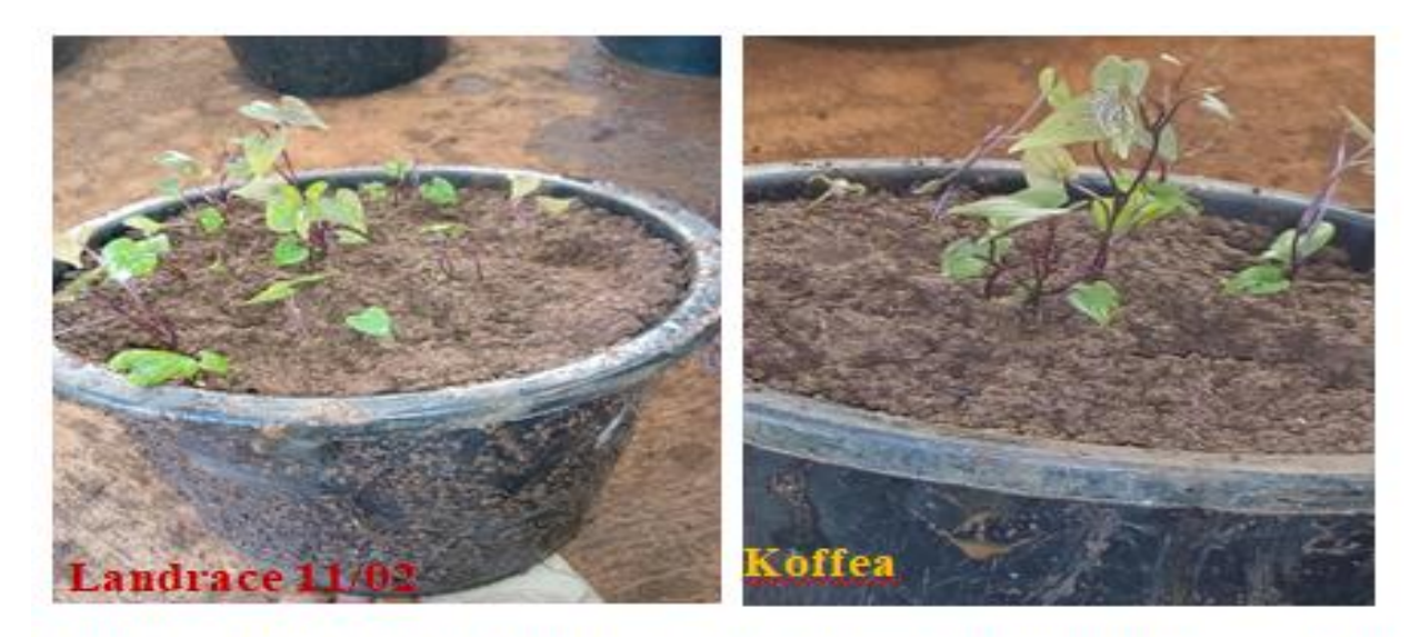
Figure 3. Acclimatized plantlets of two yam landraces after one month in greenhouse